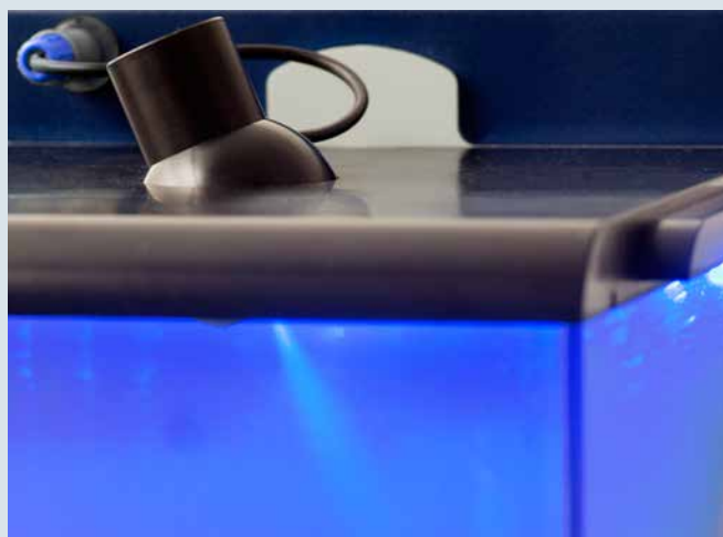
The nozzle generates an extremely fine reagent mist.

Any residue remaining in the gas phase is automatically aspirated by the integrated pump and collected in the wash bottle behind the instrument. After the reagent transfer has been completed, the hood lifts at the push of a button and the TLC/HPTLC plate can be removed for further processing.