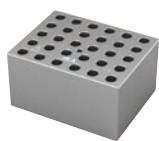
DB 1.1 Single block Suitable for: PCR tubes

* Dimensions (W × H × D): 95 × 76 × 51 mm