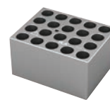
DB 4.4 Single block Suitable for: Standard test tubes