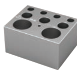
DB 3.2 Single block Suitable for: different reaction vials