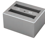
DB 8.1 Single block Suitable for: Cuvettes