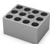
DB 2.1 Single block Suitable for: Conical tubes