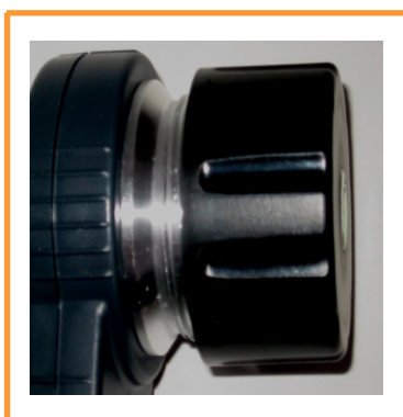
Figure 1 c

✘ Screw cap under tightened. Stainless steel indicator sunken in cap