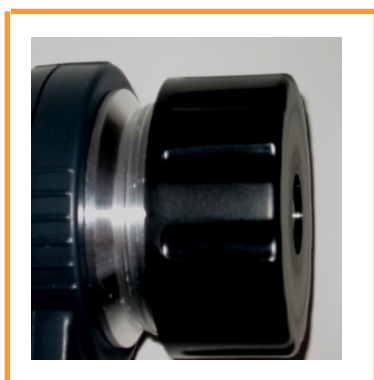
Figure 1 b

✘ Screw cap under tightened. Stainless steel indicator sunken in cap