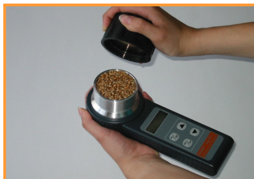
Figure 1a. Fill the measuring cell evenly to the top, ensuring the crop is level with the top of the cell. Screw on the cap and tighten until the stainless steel pressure indicator is flush with the top of the cap.