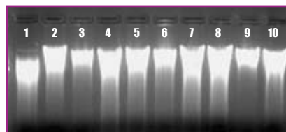
DNA from various soil samples extracted with the FastDNA Spin Kit for Soil. 20% of the DNA isolated from 500 mg soil was loaded on a 1.2%

Kit Components: RNApro™ Soil Lysis Solution, Lysing Matrix E, Phenol:Chloroform (1:1), Inhibitor Removal Solution, DEPC-treated H 2 O, RNAMATRIX® Binding Solution, RNAMATRIX® Slurry, RNAMATRIX® Wash Solution Concentrate, Quick-Clean Spin Filters