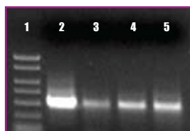
RT-PCR of fungal gene from total RNA isolated from soil samples with the FastRNA Pro Soil-Direct Kit. Approximately 40% of the RT-PCR reaction was loaded on to a 0.8% agarose gel. Lane 1: 150 bp–2 kb marker, Lane 2: Soil #1, Lane 3: Soil #5, Lane 4: Soil #10, Lane 5: Soil #11.

The FastRNA Pro Soil Kits are designed to efficiently isolate total RNA from organic material found in soil samples and soil sample supernatants.