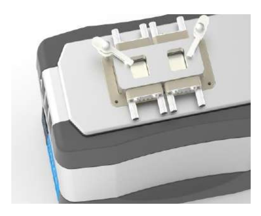
H Interface Temperature Control Unit (Part No. 3200429)

The H Interface Temperature Control Kit enables microfluidic experiments utilising the precise thermal control of the TCU-100 with a range of droplet junction, droplet merging and Y-junction chips. Compatible with the popular and economical 15 x 22.5 x 4 mm chip format, 2x Linear Connector 4-way (Part No.3000024) and H Interface (Part No. 3000155), this kit features a heat plate adaptor and insulative cover for 2 microfluidic set-ups in parallel. Good thermal contact is ensured by mounting the H Interface Temperature Control Kit using the Sample Clips provided with the TCU-100 (Part No. 3200430).