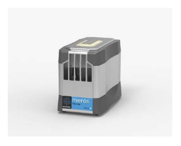
Meros TCU-100 (Part No. 3200428)

The Meros TCU-100 has a hot/cold plate area of 60mm x 22.5mm and comes with 4 optional, flexible sample clips. Holes in the plate allow dowel pins to be mounted for chip alignment. This combination enables a wide range of chips (including non-Dolomite chips), microscope slides or other devices to be quickly and securely held in place ensuring excellent thermal contact. The TCU-100 is compatible with chip and microscope sizes up to 25 x 75mm. Standard chip sizes such as