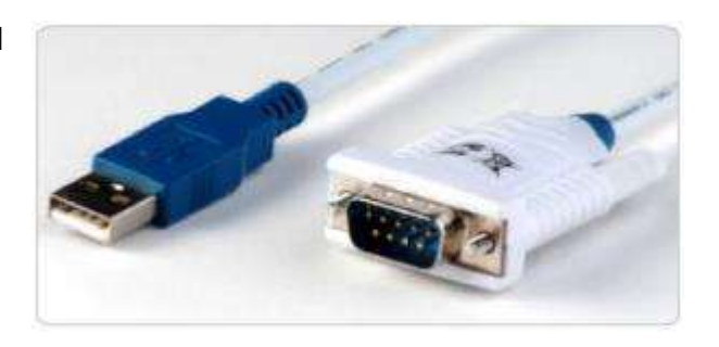
USB to RS232 Adaptor Cable (Part No. 3200197)

For PCs that do not have an RS232 serial interface, Dolomite offers a RS232 to USB Adaptor Module cable which allows users to connect their Meros TCU-100 to a PC.