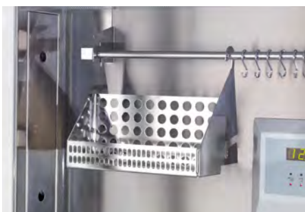
Utility basket with hanging bar increases flexibility of the working area and helps improve organisation