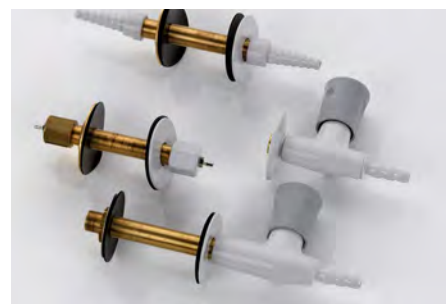
Side wall service taps are easy to install