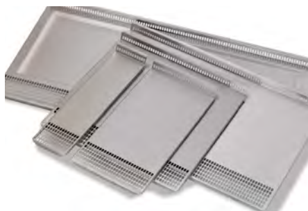
Configurable work surface improves flexibility of the working area