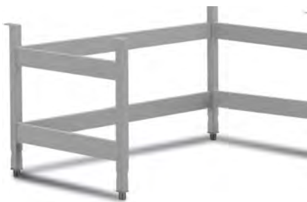
Manually adjustable stand enables cabinet to be set at a comfortable working position between 750-950mm