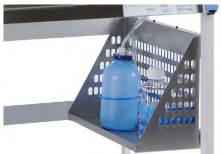
SmartPort floor stand hanging shelf to keep area beneath cabinet clear to ensure adequate legroom for a comfortable working position