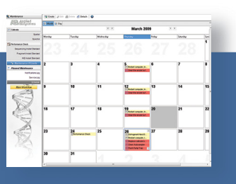
Plate setup Monitor run