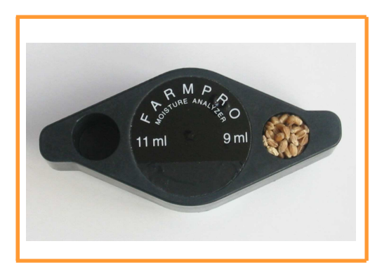
Figure 1a. Fill the measuring cup to the top, ensuring the crop is level with the top of the grinder/compressor cap.