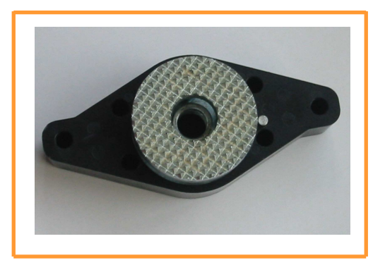
Figure 1 c. Place grinder/compressor cap onto shaft of measuring cell. Rotate clockwise. Note: Stainless steel stop pin on right-hand side of cap