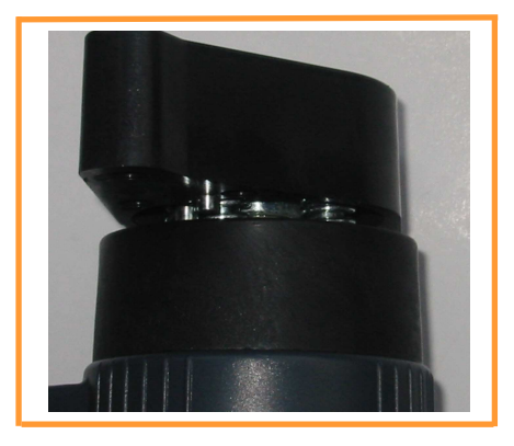
Figure 1 d. Screw down the cap clockwise until the stainless steel stop pin in the cap and measuring cell prevent further rotation.