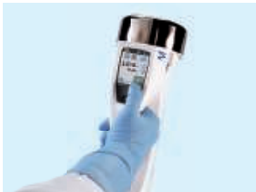
Close the protection cap – system ready to start