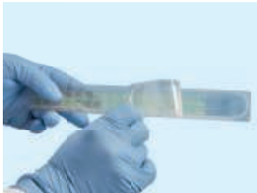
Open HYCON® agar strip wrapper