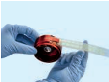
Insert HYCON® agar strip into rotor