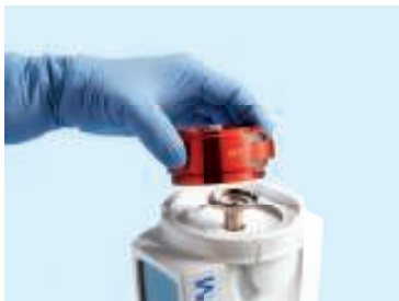
Place rotor on instrument