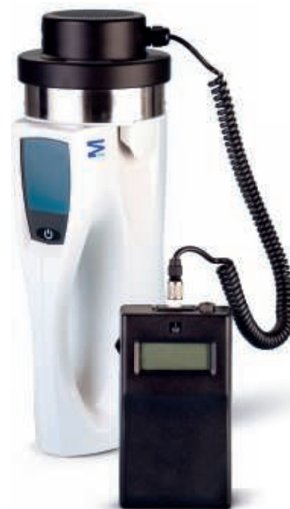
RCS® High Flow Touch Microbial Air Sampler with HYCON® Anemometer