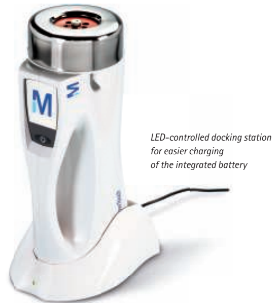
LED-controlled docking station for easier charging of the integrated battery