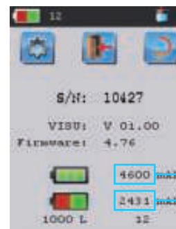
System information window displaying battery capacities